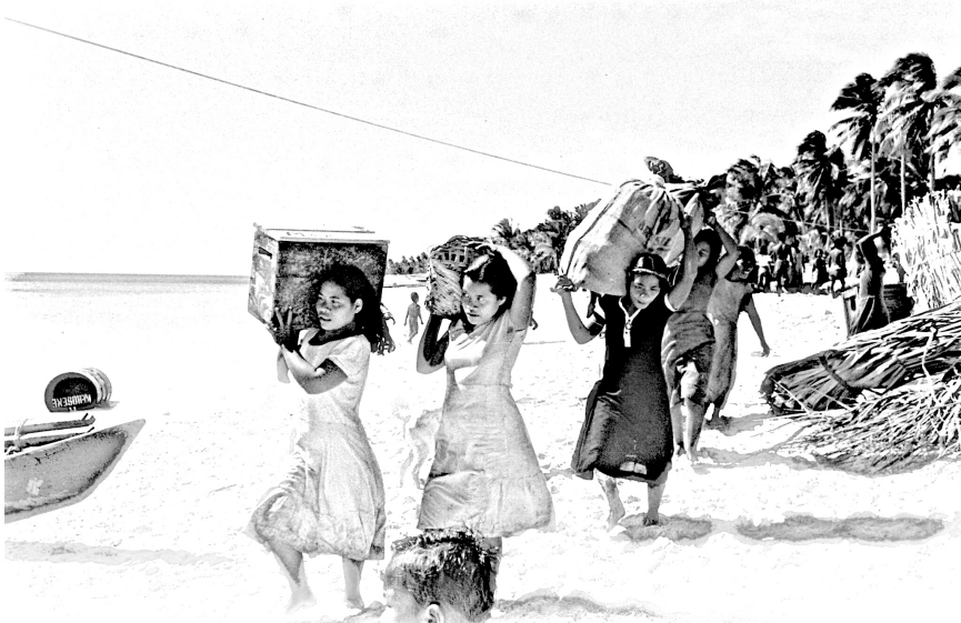
Marshallese women and children of the Bikini Atoll displaced by America in preparation for the 1946 Operation Crossroads nuclear weapons test

Sources plus more history and current events at historyiswhat.noblogs.org