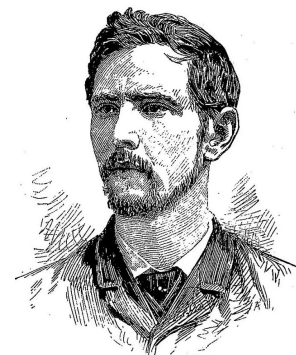
ADOLPH FISCHER.