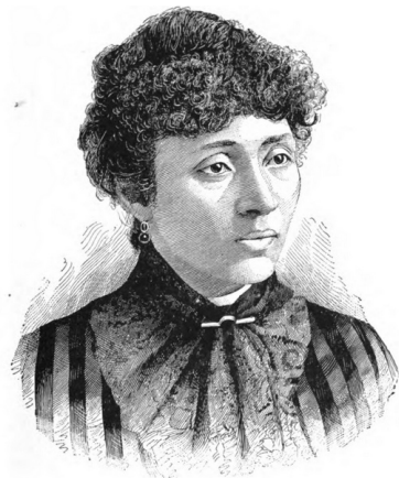
Lucy E. Parsons,

There are certain things which are priceless, among which is life, liberty and happiness, and these are the things which the society of the future, the free society, will guarantee to all without money and without price. Buying and selling is but another name for robbing and killing. When labor is no longer for sale, it will be forever free. The way out of the house of bondage is to no longer buy or sell.