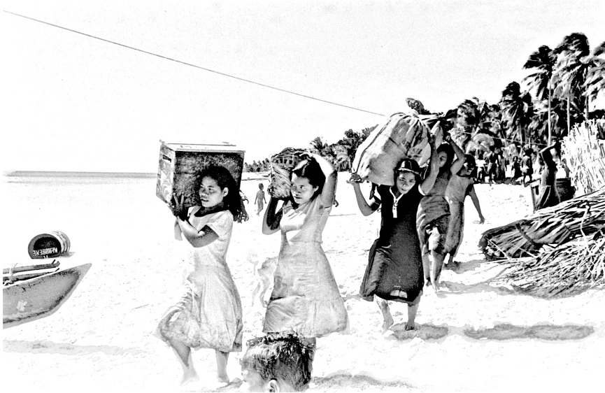
Marshallese women and children of the Bikini Atoll displaced by America in preparation for the 1946 Operation Crossroads nuclear weapons test