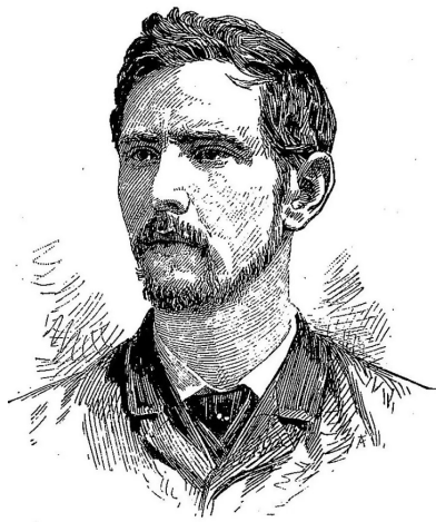
ADOLPH FISCHER. From a Photograph taken by the Police.