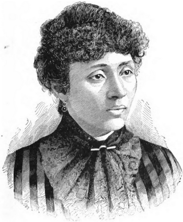
Lucy E. Parsons,

References and Sources at historyiswhat.noblogs.org